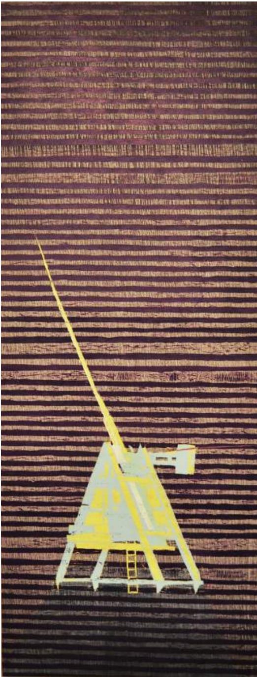
Joana Kairienė Nuovo direttore. 2013 Woodblock print, oil on canvas 200 x 77 cm