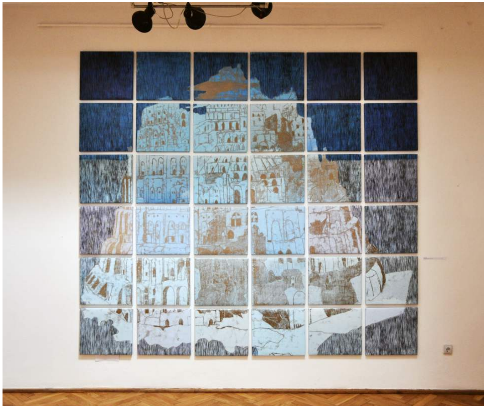
Joana Kairienė The Tower of Babel. 2014 Monotype, woodblock print, oil on canvas. 36 pieces, each piece size 40 x 46 cm, total size 255x291cm