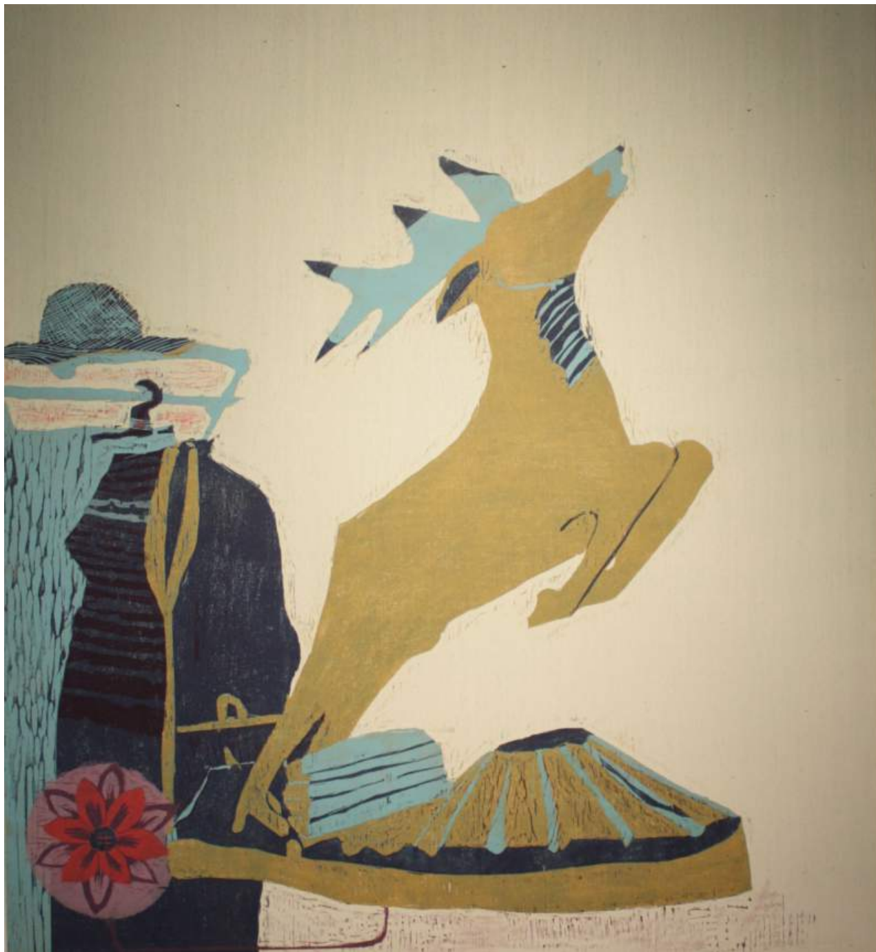
Joana Kairienė Like and old dream, part of the cycle "Again". 2012 Woodblock print oil on canvas. 120 x 110 cm