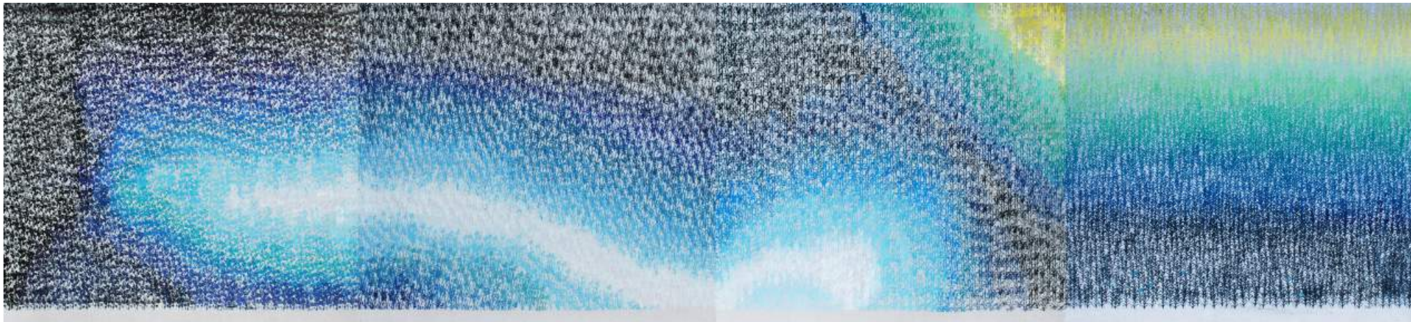
Joana Kairienė Landscape of light. 2015. linocut stamps, oil on canvas, 120 x 520cm